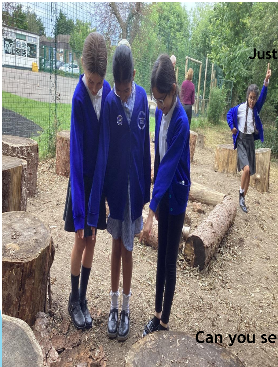
Just a little Saturday Night Fever