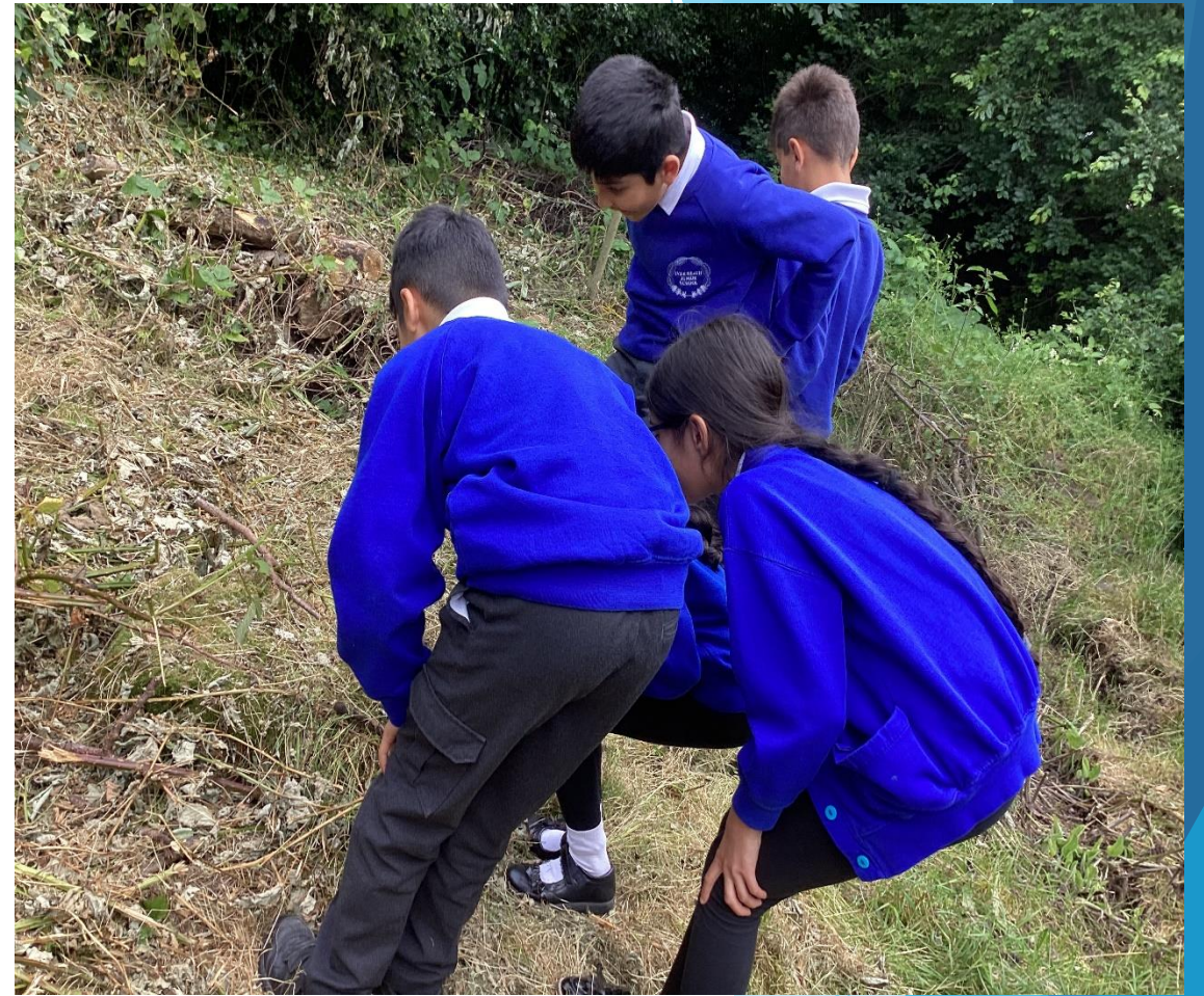
I'm sure I saw it go that way