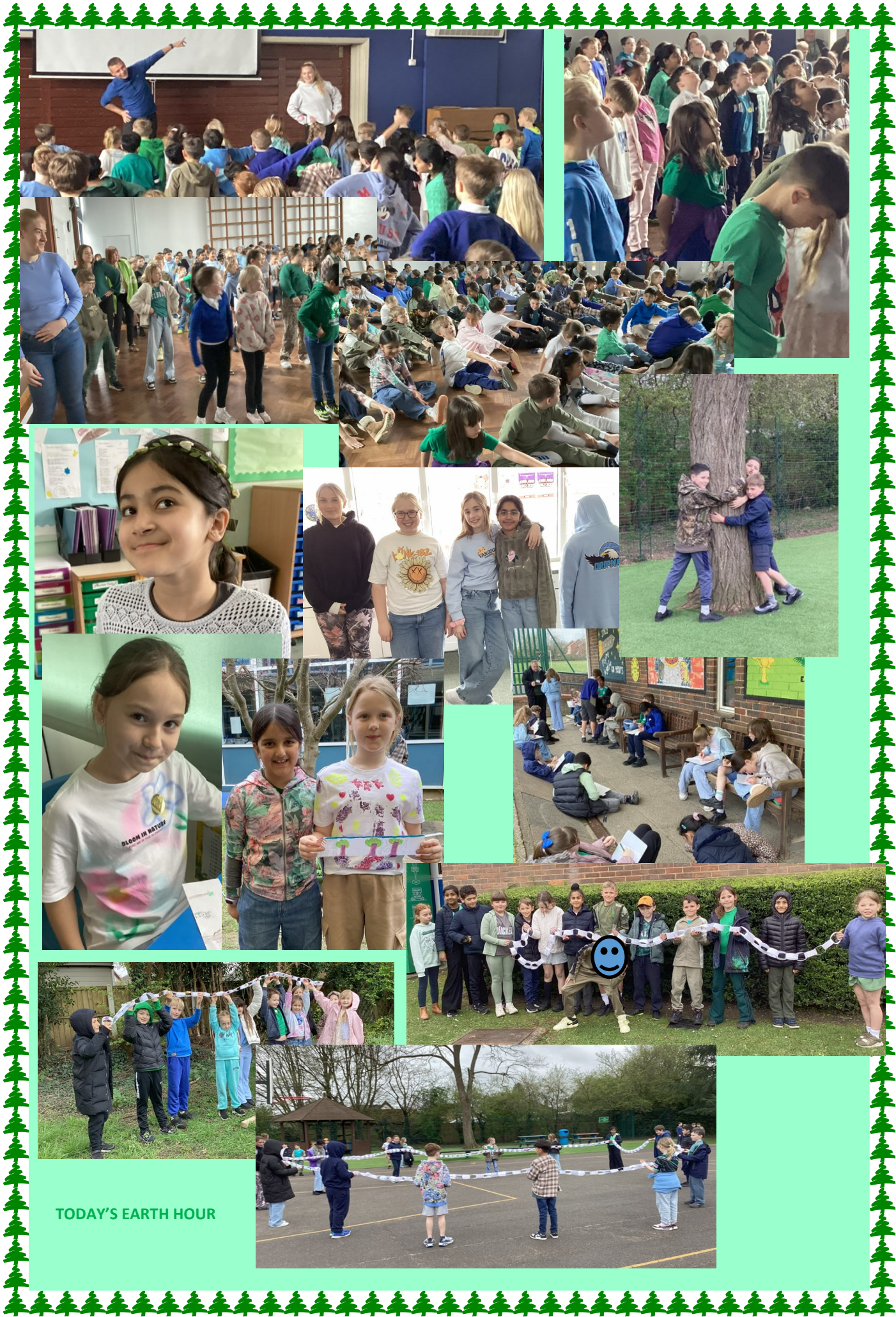
TODAY'S EARTH HOUR